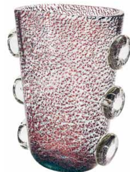
Vase Design: Ercole Barovier, 1935/36 Produced by: Ferro Toso Barovier Glass, hand-blown; metal oxides, adorned Collection Lutz Holz

Murano is the embodiment of Italian glass design par excellence. The tradition goes back to the 14th century when Venice relocated its famous glass production to the neighbouring island. After some eventful decades, the island glass production experienced a new heyday in the 20th century, which began at the end of the 1920s and continues to fascinate to this day. Works of the highest artistic standard have been created in the numerous workshops of the lagoon city. Precious glass in all its facets – fine net patterns, solid vessel objects with polished surfaces – inspire collectors and lovers alike. The exhibition, which showcases pieces from the Lutz Holz collection, focuses on manufacturers such as Barovier & Toso as well as Venini and Seguso, who not only realised their own designs, but also sketches by other renowned glass designers.