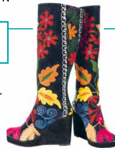
Boots »Flora's Present« Italy, Germany, 2017 Embroidery in silk on textile surface

Including extensive catalog, 232 pages, Sandtein-Verlag, German/English