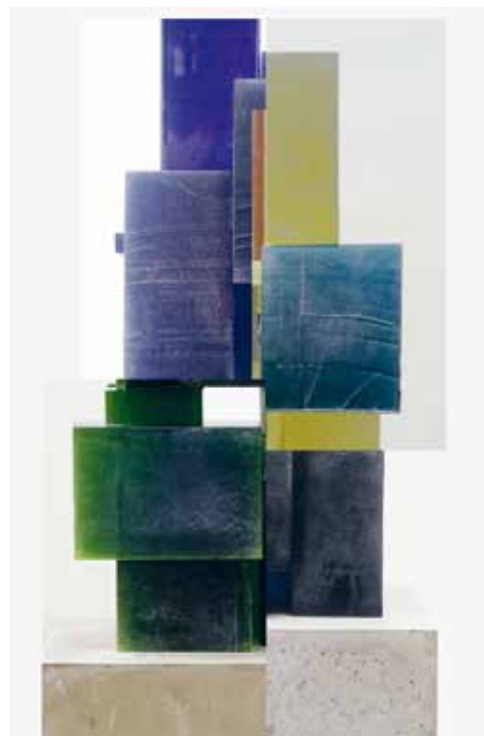
Kai Schiemenz Green, Yellow, Blue, Collage of glass sculptures