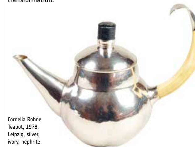
Cornelia Rohne Teapot, 1978, Leipzig, silver, ivory, nephrite

Since the beginning of civilization, the exchange between cultures has had an impact on the arts, crafts, and design. Globalisation is not merely characteristic of our time – centuries ago humans, but also art objects crossed national borders and continents and found »new homes«. In these new lands, people encountered a different way of understanding, oftentimes they were even confronted with misunderstanding. Works of art, their shapes, decors and the techniques used to craft them were and are subject to transformation.