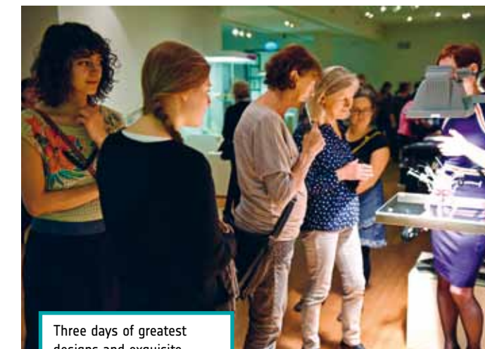
Three days of greatest designs and exquisite handicrafts on two floors!

In 2021, our aim is to continue to set thematic and geographical emphases. This will help us showcase the diversity among our international exhibitors. The high standards of the exhibitors and the international atmosphere will set the tone and attract design and art enthusiasts from the region and all over the world. As usual, the fair will focus on high-quality applied art and design in areas such as jewellery, ceramics, glass, metal, and furniture. Over the course of three days, visitors will have the opportunity to view and learn more about the exhibits, enjoy good conversations and buy art.