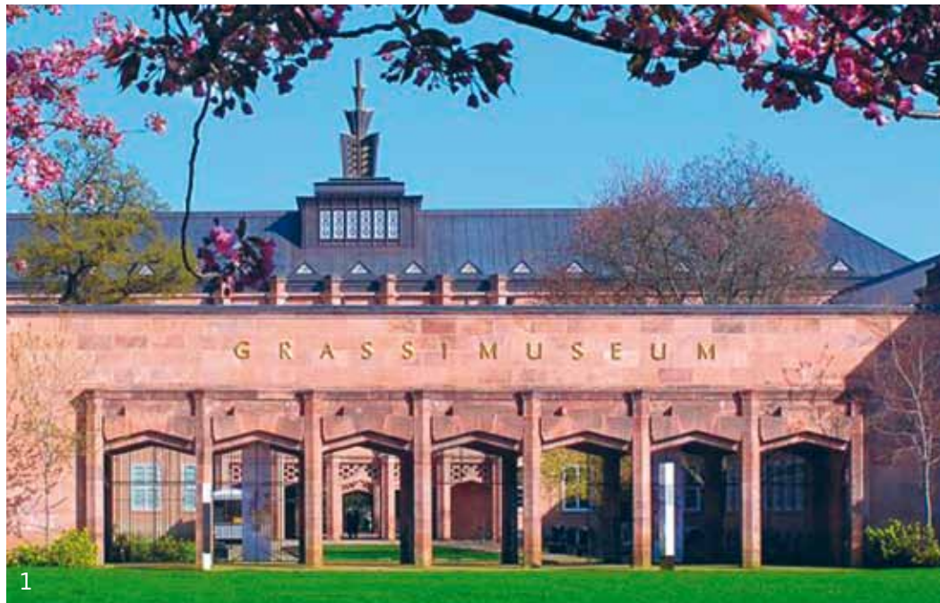
1 View on the portal of the Grassi Museum 2 Vase "Jack-the-pulpit" Louis Comfort Tiffany, Glass & Decorating Company, New York, around 1900