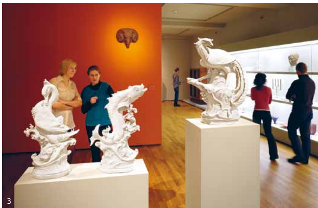
3 Visitors at the exhibition "From Art Nouveau to the Present" 4 Ludwig Mies van der Rohe, model MR 90 "Barcelona Chair", 1929

The Grassimuseum hosts three internationally acclaimed museums: the Museum of Applied Arts, the Ethnography Museum and the Musical Instruments Museum. The building owes its name to the merchant and patron Franz Dominic Grassi. Today's GRASSI Museum of Applied Arts was founded in 1873 as a museum of decorative arts and opened in 1874 as the second German museum belonging to this genre. Supported and promoted by the Leipzig citizenry, it developed from a collection of models to one of the most important museums of its kind in Europe. The museum displays changing exhibitions on arts and crafts, design, photography and architecture of international rank. In addition, it offers the artistically staged Permanent Exhibition with emphasis on Art Nouveau. The museum promotes the scene of artisans and young designers and accompanies children, adolescents and adults in their discovery tours through 3,000 years of art and cultural history.