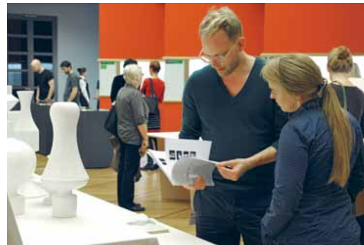
The GRASSIMESSE is considered a melting pot for creative people, art and design lovers

The Permanent Exhibitions are accompanied by a versatile programme of Special Exhibitions. It is dedicated to all areas of design and ranges from historical topics to current design to photography and architecture. The GRASSIMESSE, held at the end of October, represents an annual recurrent highlight. Established as early as 1920, it entered the history of design as one of the first performance shows of its kind and as a "meeting point for modern art". Since its revival in 1997, it has re-established itself as an international forum for applied arts and design. A jury of experts guarantees the high standard of the exhibited works. The international participants present a broad spectrum between classical handicraft and experimentally conceptual design. Visitors can enjoy a variety of creative design options that invite them to have a look, get information and buy.