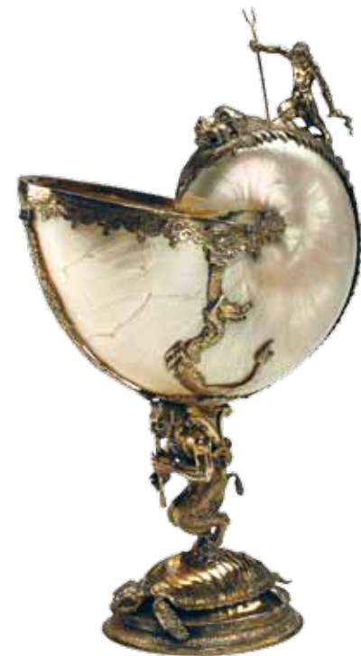
Nautilus goblet, Enkhuizen (The Netherlands), around 1600, silver, moulded, embossed, engraved, gold-plated

In addition to existing publications, the digital museum is becoming increasingly relevant.