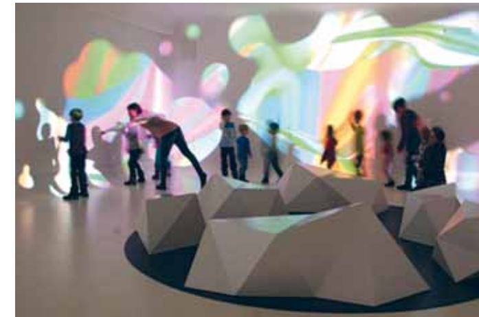
Even the youngest are fascinated by the interactive 360° installation "Sinneslandschaften"

The Grassimuseum hosts three internationally acclaimed museums: the Museum of Applied Arts, the Ethnography Museum and the Musical Instruments Museum. The building owes its name to the merchant and patron Franz Dominic Grassi. Today's GRASSI Museum of Applied Arts was founded in 1873 as a museum of decorative arts and opened in 1874 as the second German museum belonging to this genre. Supported and promoted by the Leipzig citizenry, it developed from a collection of models to one of the most important museums of its kind in Europe. The museum displays changing exhibitions on arts and crafts, design, photography and architecture of international rank. In addition, it offers the artistically staged Permanent Exhibition with emphasis on Art Nouveau. The museum promotes the scene of artisans and young designers and accompanies children, adolescents and adults in their discovery tours through 3,000 years of art and cultural history.